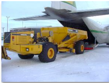
Heavy Lift & Oversized Capability

Their fleet of iconic Lockheed 382G Hercules Air Freighter (C130) aircraft have carried cargo as odd as live killer whales and wood bison and they have operated from the Arctic to the African interior. In addition to carrying cargo, their services include disaster relief, firefighting and oil spill response.