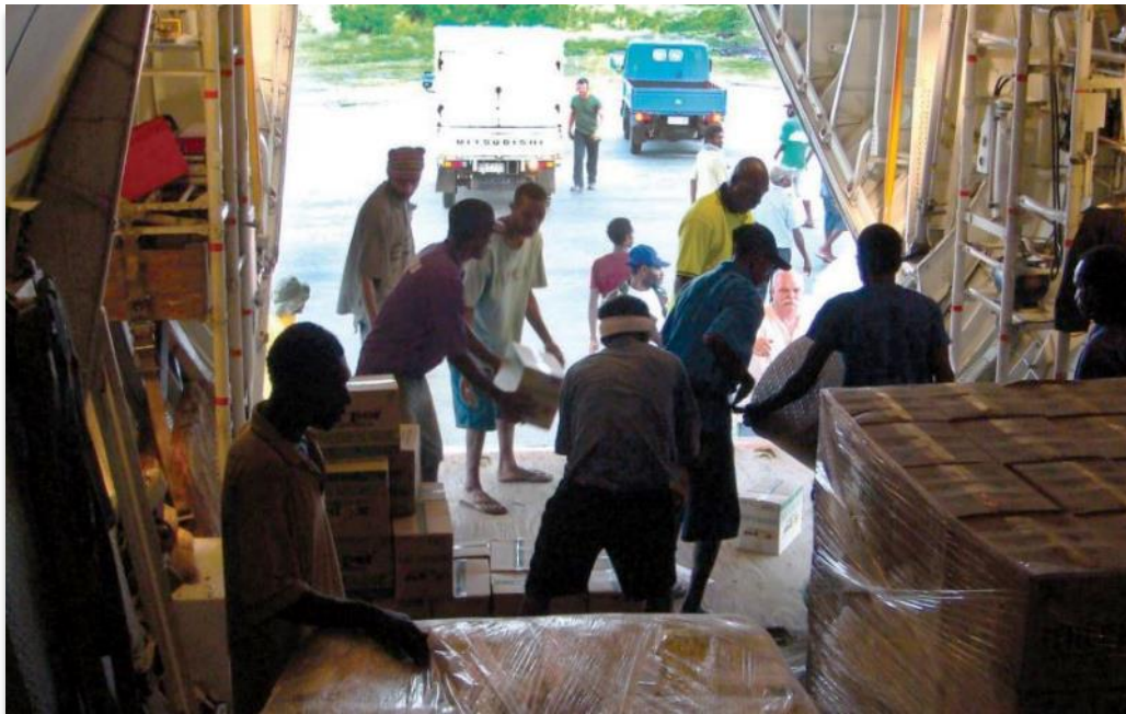
Disaster Relief Work

Lynden Air Cargo is planning to utilize the DZMx form feature, to compile and send pre-formatted reports off the aircraft.