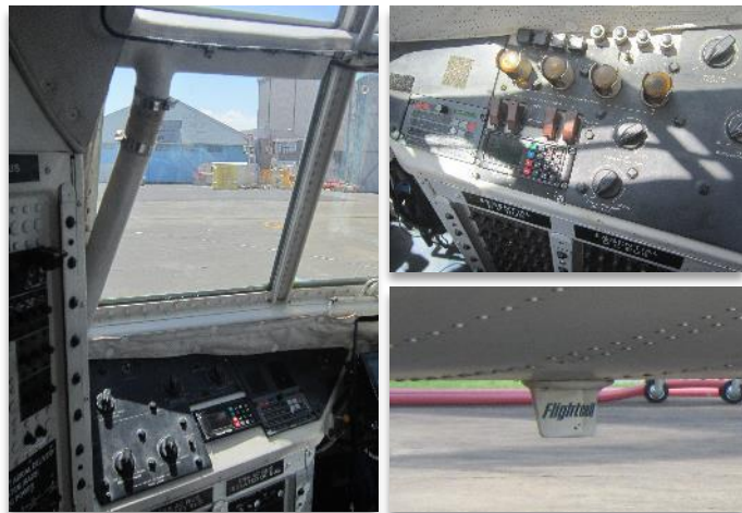
DZMx, DZMx Remote Head and Cellular Antenna

DZMx with remote heads were installed to provide operation from both sides of the Hercules cockpits. The units were configured for worldwide coverage of voice, data and flight tracking utilizing both Iridium and cellular networks. WiFi routers were