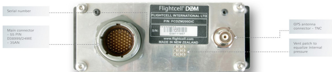
FIGURE 2: REAR PANEL – ALL DZM2 UNITS