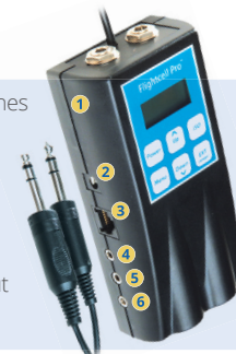
Model pictured is Flightcell Pro GA / Civil