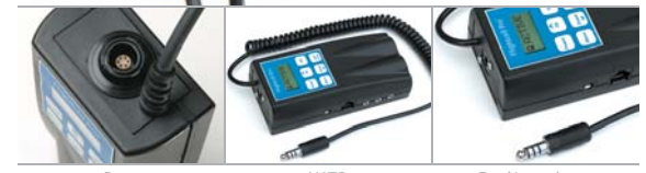
Bose NATO Dual impedance