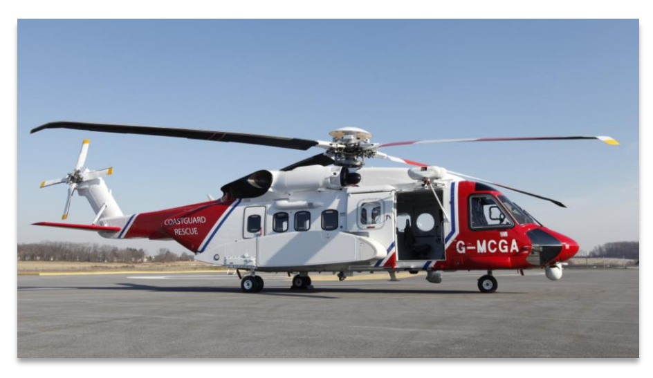
Sikorsky S-92 Ready for Action

The DZM units have been very reliable and Bristow are pleased with the support they have received from Flightcell. Their technical support staff have always been available and responsive, despite the time difference between the UK and New Zealand.