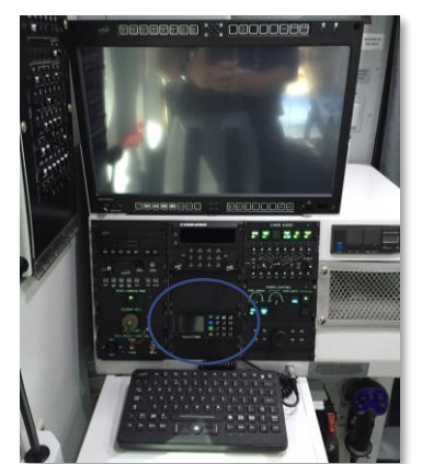
Mission Management Consol Example with DZMx Installed

Bristow selected the DZM product platform to do the job. The DZM was an attractive proposition; being an all-in-one box solution with user-friendly keypad on the front